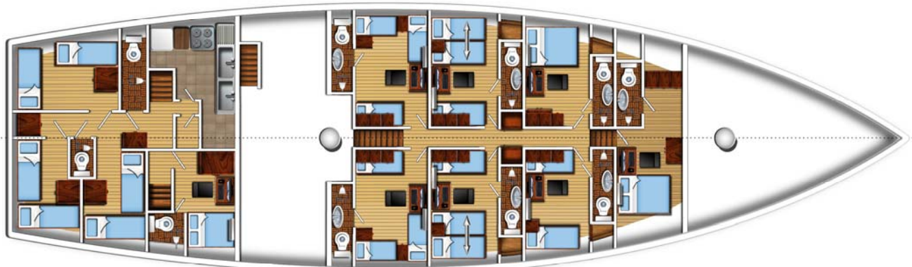
Lower Accommodation Deck